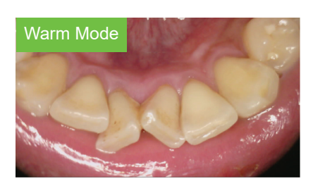
Same color chart image with xrite